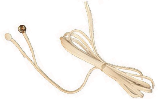
P141 Connection cable

P142A Cotton sheet with embedded sensing wires suitable for use in vomit detection over a pillow. Can also be used for urination, where comfort or discretion is important. The connecting cable is removed for laundering. Size of sensing area 90*60 cm, with 30 cm side extensions to tuck over mattress