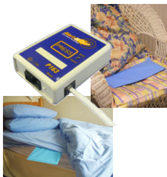
Bed or Chair leaving