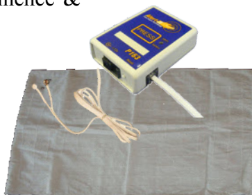
Incontinence & Vomit