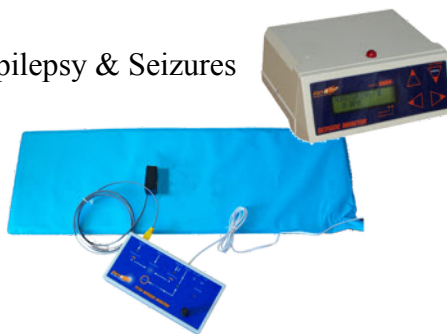
Epilepsy & Seizures

The radio based care monitoring systems from Alert-iT are recognised as the most advanced and reliable available. They are to be found in care homes and schools as well as many domestic residences. They are specified by local authorities, PCT's, Housing Associations and Assistive Technology providers. The same powerful monitors are all now available for direct connection to established Nurse Call systems, turning the old patient call button facility into a modern, effective care system that improves vigilance for vulnerable people and releases staff for care duties rather than routine checking.